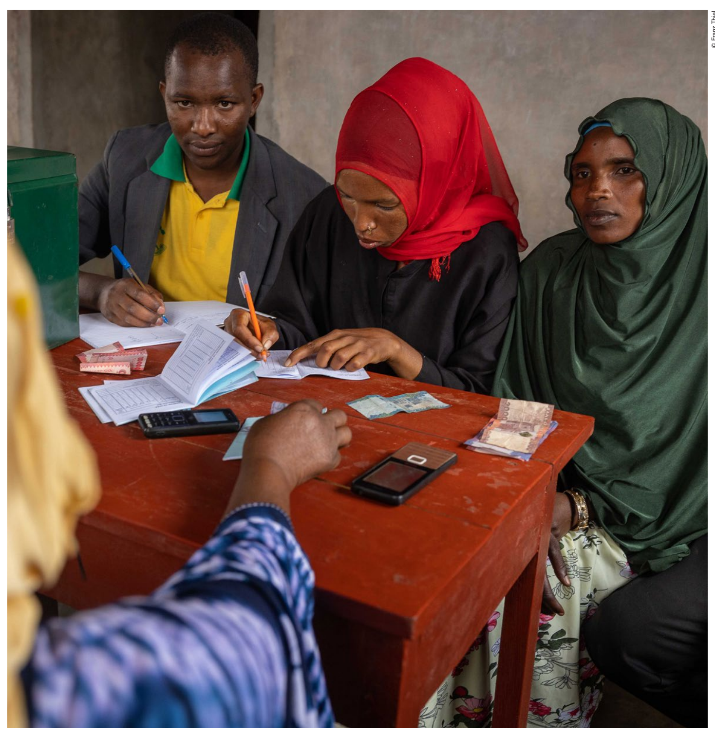
A business collective in Kinyeto (Tanzania) doing the bookkeeping.